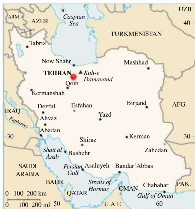
Figure 1. Map of study area.

ditches which act as main breeding places for Cx. pipiens complex.