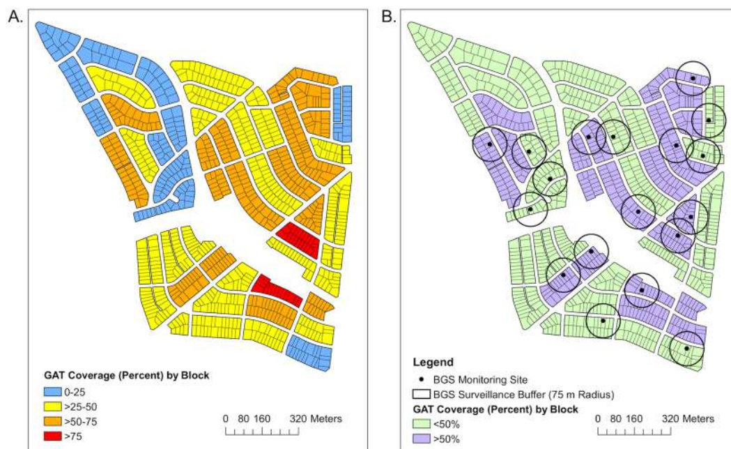
Figure 1. (A) Individual Gravid Aedes Trap (GAT) coverages (percentage of yards with traps) for all blocks in University Park, MD and (B) selected high (>50%) and low (<50%) coverage adult Ae. albopictus surveillance blocks. Participating households purchased 2 GAT traps; one for the front yard and one for the backyard. BGS refers to the BioGents Sentinel trap used to monitor host-seeking female abundance for research results 29 . To protect the privacy of the residents the specific locations of the yards with GATs are not visualized but de-identified data are available upon request.